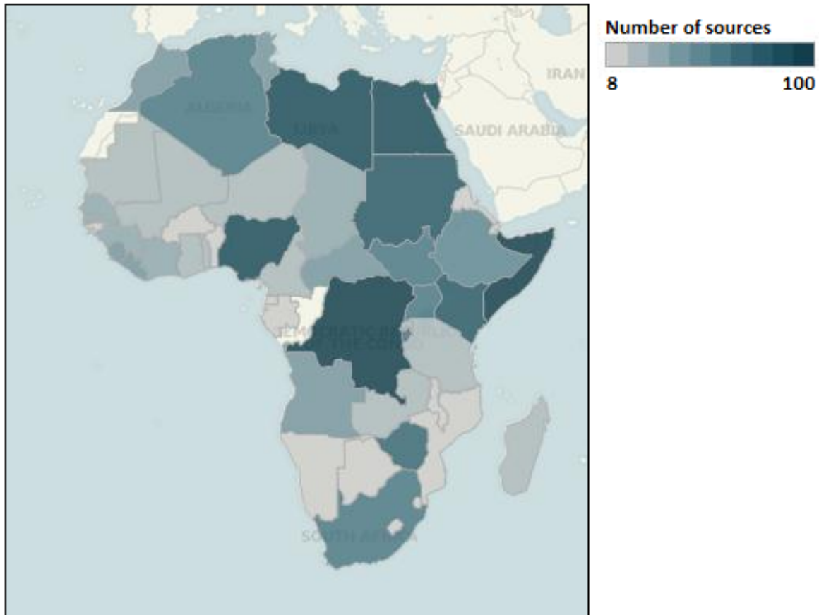
Figure 2: Countries by discrete number of sources (8 - 100), all years.

When organised by type, international sources – including international press wire services, global news agencies, and national sources published outside the country in question – clearly constitute the majority of ACLED sources, although the proportion these sources represents ranges from 41.6% in 2008 to 78.5% in 1999. National sources have constituted a growing proportion of sources over the fifteen years of the dataset’s coverage, reaching 34.4% of data sources in 2011. Regional sources – including Africa-specific news and analysis sources – have constituted approximately 8.1% of sources over the course of the dataset.